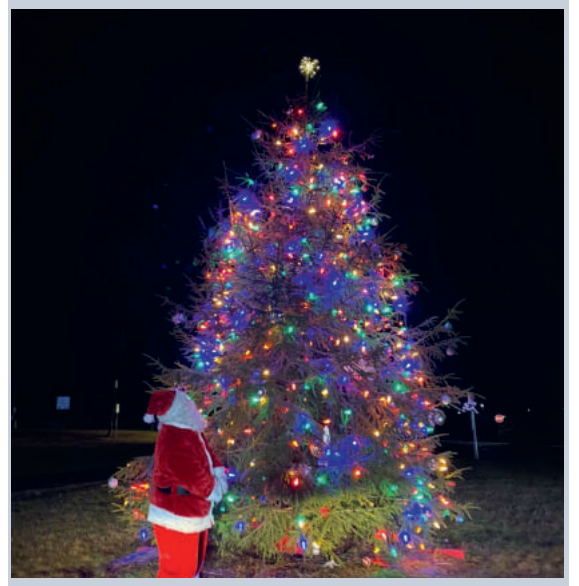
Dallas Township Christmas Tree Lighting

The Dallas Township tree lighting event will take place on Saturday, December 4th from 5:00pm-7:00pm at the Back Mountain Little League Field! Some event highlights include: photos with Santa, an appearance by Elsa and Anna, music, and free food and giveaways for all!